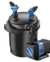
The type of pump:STP-3800(20W)