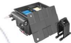
CBF-550 (Cleaning tools)