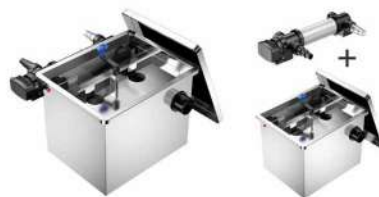
CNF-202 (UV lamp needs separately purchase)