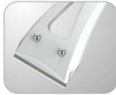
Scraping algae knife