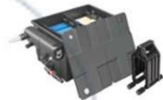
CBF-550 (Cleaning tools)