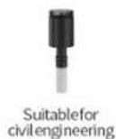
Suitable for civil engineering