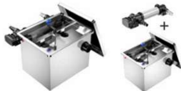
CNF-202 (UV lamp needs separately purchase)