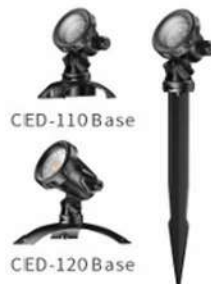
CED-110 Base CED-120 Base