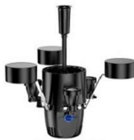
CED-105/CLD-302 (separately purchase)