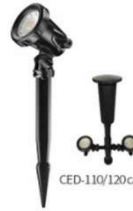
CED-110/120 can connect to CFA-11