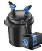
The type of pump:STP-3800(20W)